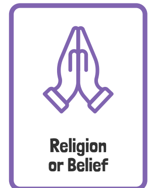
Religion or Belief