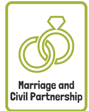
Marriage and Civil Partnership