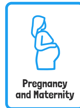
Pregnancy and Maternity